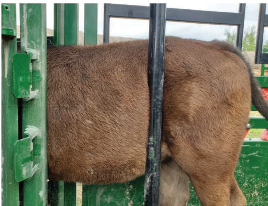
CLOSE-UP OF RIB AND HIP AREA