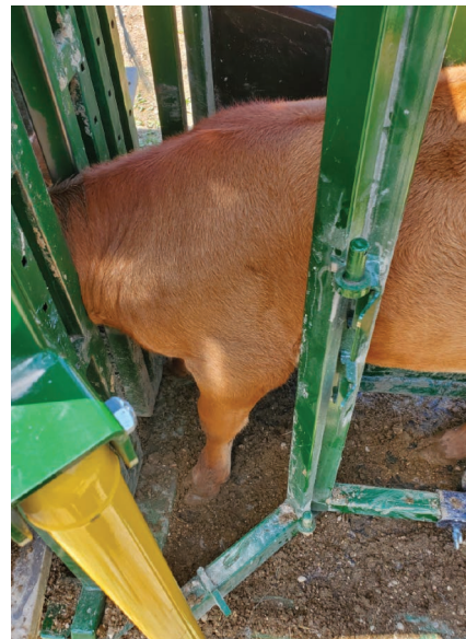
CLOSE-UP TOP VIEW OF SHOULDER ACCESS