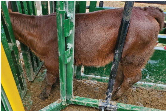
SHOULDER, RIB AND HIP ACCESS

When added to our chutes, the trimming bar makes handling calves much easier. It allows calves to be handled in a natural position, rather than tipping the animal over. When used with the squeeze, the trimming bar immobilizes the calf. This allows you to completely open the side access door, giving you full access to the side of the calf. The trimming bar is adjustable and allows for any size of animal, as shown below with pictures of calves that are under 3 months old.