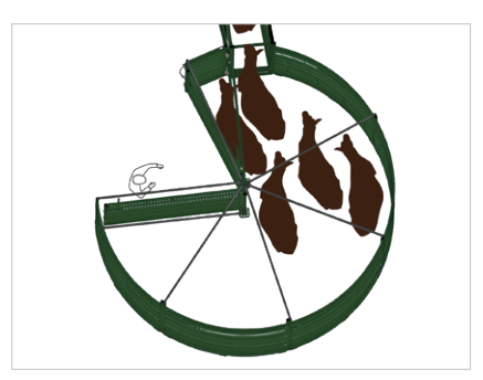
If a cow hesitates to exit the forcing pen, the next one can take charge and continue flow