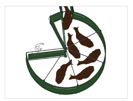
Cattle move easily into the race with no force