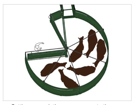
Cattle approach the open access to the race