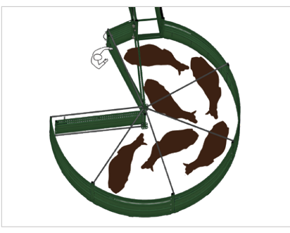
Cattle naturally turn back to where they entered