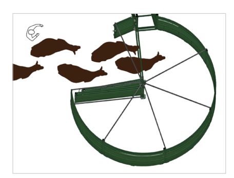
Cattle enter the 3E BudFlow Forcing Pen by seeing light through the 3E panels, and you close the entry gate behind them