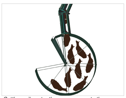
Cattle easily enter the open access to the races