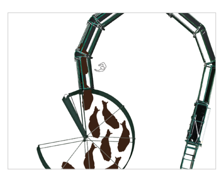
The operator can use point of balance handling techniques to maintain continuous flow